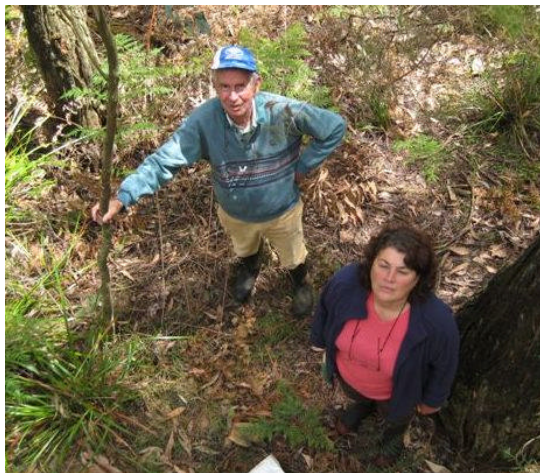
Above: In another clearing, probably a former swampy area that is now dry, Kurri Kurri members provided much advice on how to photograph small plants.